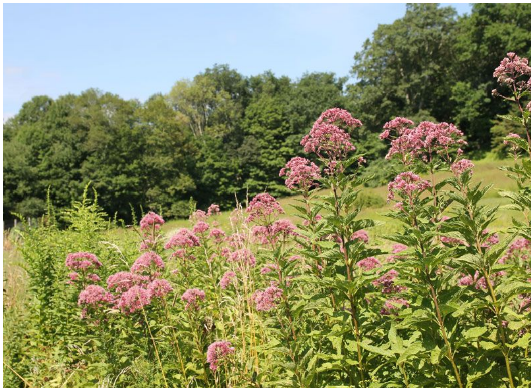
Pollinator meadow, Lachat Town Farm, Summer 2018

Weston Garden Club, Lachat Town Farm, Sustainable Weston